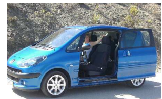
rental Peugeot 1007

At 4.20 am the front doorbell rings. Because our neighbour is on holiday, Paul, the club-secretary of the ABC ☺, our bowls club volunteered to bring us to Schiphol. It is very quiet on the road so we arrive at Schiphol very quickly. After saying goodbye to Paul, who wanted to get home fast to go back to bed, we went to check in for our flight. Nowadays it is possible to check in yourself, so we were able to choose row 14 (near the exit). After almost two and a half hours flying time, we start descending to the airport of Faro in the Algarve. Since there is a one hour time difference we have to set our clocks 1 hour earlier. We land at 9.20 am Portuguese time. Nice and early, so we still have the whole day ahead of us. It is a cloudless blue sky and the temperature is already 23 degrees Celsius, which is promising for the next few days. After collecting the suitcases we go to Guerain, the car rental firm our tour operator Vaya.nl deals with. We booked the cheapest a-type car. Usually this means the smallest car without air co available. We thought we would be getting a cheap Audi, but after dealing with the administration, we went out with the keys of a nice blue Peugeot 1007. A car with air co and a lot of electronic gadgets, among which electrical opening sliding doors. Also it appeared to have a diesel engine. That saves on petrol. What a luxury, quite different from my daily "Goddess", a Citroen DS. Recently we celebrated its 40 th birthday (September 26 2007)..