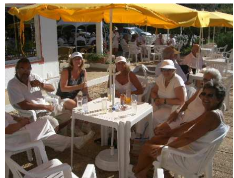
A nice drink during the interval