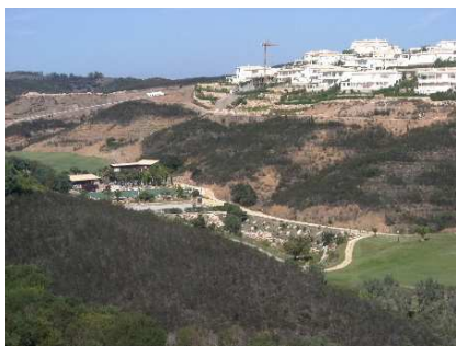
In the far distance the bowls green