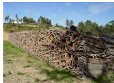
Stacks of drying cork