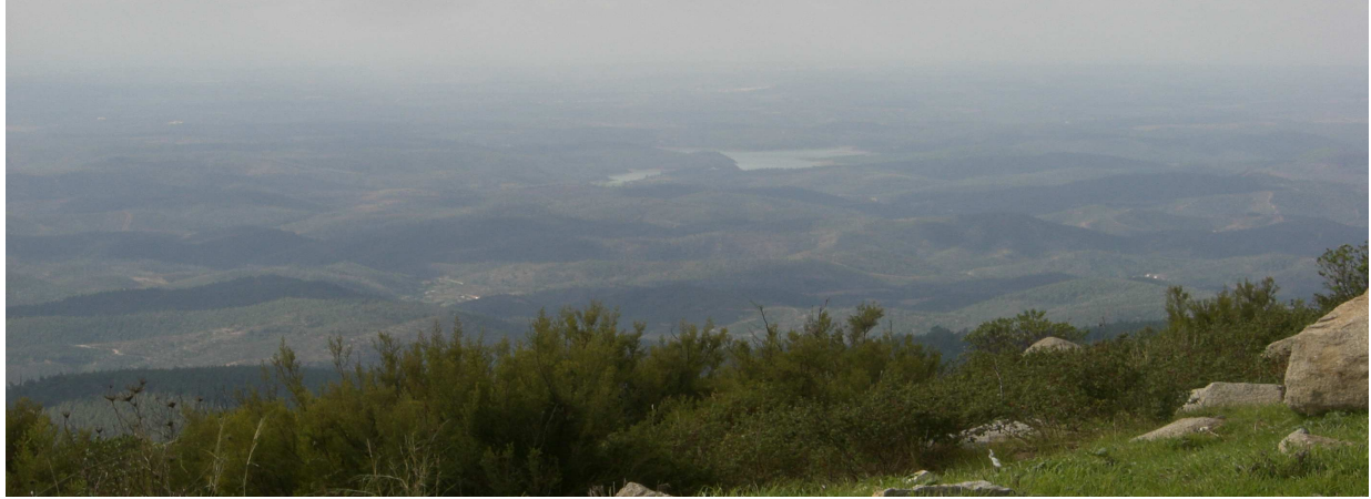
View looking towards the sea. The lakes can be seen in the centre.

We leave nice and early in the direction of the Monchique mountains. First we visit Silves, because I think there is a palace with a garden containing beautifully tiled pieces of art. Unfortunately this is not the case. There is a nice historical town centre with narrow streets you can just about get through in a small car. From Silves we carry on in the direction of Monchique, a nice little town on the top of the