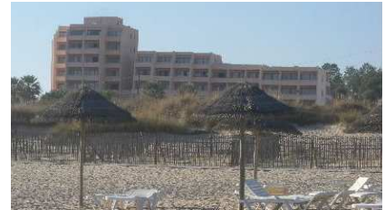
Appartemencomplex Meia Praia Beach Club

After a very nice breakfast on the balcony, again in bright sun light and a blue sky, we went to the beach opposite the apartment complex. As said before an open long beach with very few buildings. One restaurant, and that's it. It will be 25° C today and the predictions are for a slightly lower temperature of 22° C for the next few days. This is a comfortable temperature, if there is no wind, especially with the sun shining brightly. While Saskia was taking a nap in the sun I decided to have a swim in the sea. This was immediately a warning against the under currents. These were quite strong and I had to fight fairly hard to get back to the beach. Once there it took a couple of minutes to catch my breath. Saskia never noticed a thing, except seeing me gasping for air for a few minutes. I was exhorsted by the strength it took me to get back to the beach against the under currents. The waves were not very big, but this apparently is not a sign for no or few undercurrents. Still it wasn't that bad for the rest of the holiday. From the beach we had a nice view of the land behind our hotel.