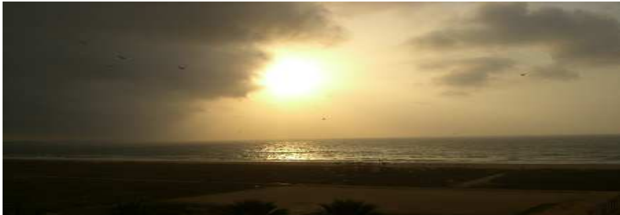
Magnificent sky with the sun half hidden behind the clouds.

Some of the guests already leave for Holland after one week. We are glad to have another week, because we want to do so many more things. The boat trip, but also visiting Taviar, an old historic town near the Spanish border. There is also a bowls green we want to visit. We want to visit all the bowls greens in the Algarve you see and if possible try them all out to be able to compare them. Further more we want to make plans for the second week. So it will be a combined activity and beach holiday. It seems we are lucky with the weather. Usually starting about mid October, the sun starts to shine less and also the temperature drops. The same period last year was a lot cooler and it rained a lot more. Lets just say that everyone gets what he or she deserves.