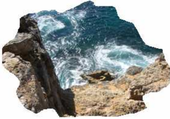
Rocky coast between Vila do Bispo en Sagres

We drive towards Sagres en S. Vicente. On our route we enjoy stunning views and we stop several times to admire the beautiful rocky coast line.