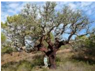
Cork tree in the Algarve

Late in the afternoon we return to our apartment to pack our things. Tomorrow we have to get up at 4.30 am.