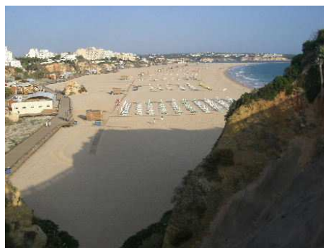
Beach Praia da Rocha

It is very nice with a very wide beach, which is just as well, thinking of all the