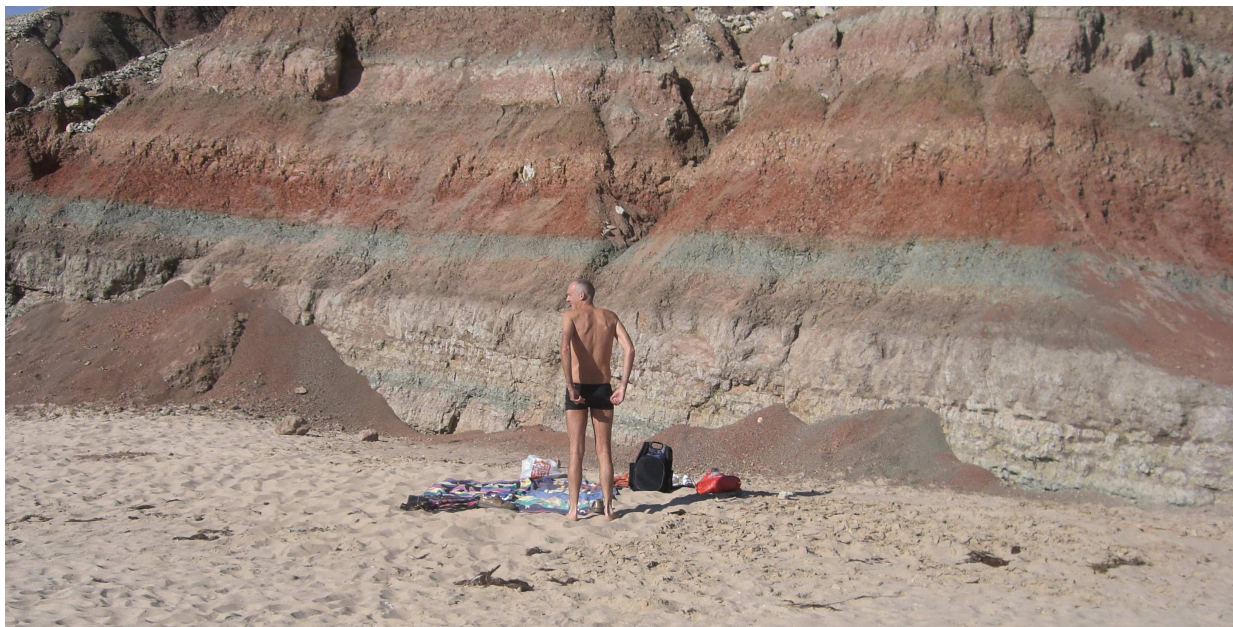
Beach on the other side of Burgau where clearly the millions of years past can be seen in the rocky cliffs.

There is no wind and a glorious sun shining in the sky. So we decide to go and find a new beach. The idea is that every beach has something different. We go to Burgau, a picturesque fishing village of which the old town is still a working fishing harbour. A new part is built next to the old town centre, for the young folks. The surrounding is very traditional and varied. We drive on to another beach where