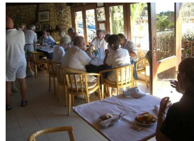
Lunch between the sets

After the games we sat down talking to the members. They are very curious about bowls in Holland. Of course we mentioned our