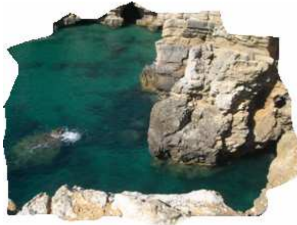
Rocky coast between Vila do Bispo en Sagres

You can walk here for hours and enjoy the rocky coastline as seen in this picture. You have to take care though, because you can easily slip on the smooth and sandy rocks.