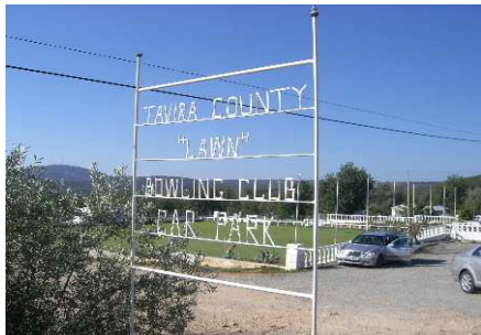
Welcome sign at the green in Tavira

We leave around 9.40 for the Spanish border and arrive at the bowls green at about 10.30. It lies a bit hidden, but thanks to the GPS address we programmed in the TomTom it was easy to find. And by a scenic route TomTom brought us in no time to the right place: Cerro de Leiria. On arrival we were told that a competition was held between the "Tigers" and the "Titans", two rival groups within the club. They were very fanatical to win their games.