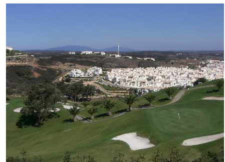
The Golf link with the luxurious villas in the background

Parque da Floresta Bowling Club. We receive a lot of information about the club and bowls in general in the Algarve. Bowls is becoming more and more popular. According to our information about 200.000 Brits live here, both Scots, Irish,