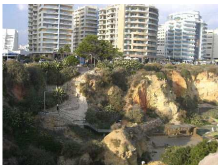
Apartments Praia da Rocha

When we have had enough of the beach we decide to have a look around in Praia da Rocha, a very