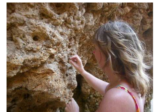
What's in all these rocks?

We don't do anything anymore and after a good meal, we play some cards and enjoy a good nights rest.