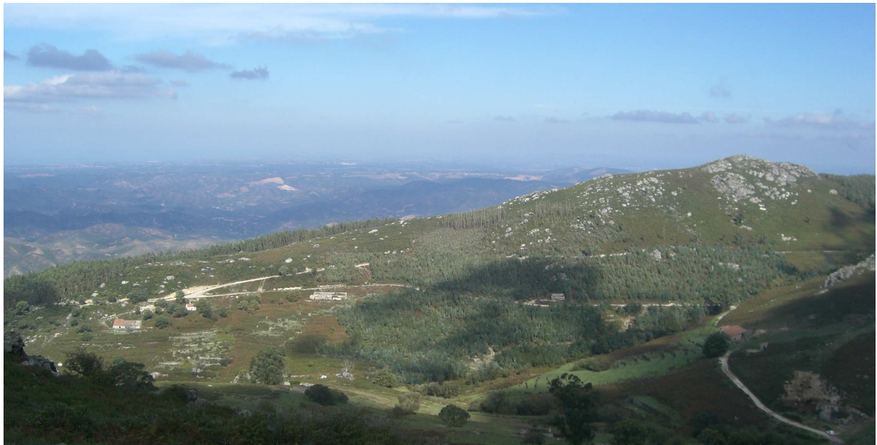
Panorama near the top at Foia

Monchique mountains. There are a lot of good view points on the way to the top where you get a good panorama of the whole area in the direction of the sea. It was a little bit hazy when we took this picture so you can't really see the sea very clearly. The photo is taken on the road to Foja. Apparently this is the best place for a panorama of the Algarve. We drive through Monchique and up the mountain to Fóia. A magnificent route and along the way the most beautiful panoramas. The clouds have disappeared by now and we have very nice views as can be seen on the next photo.