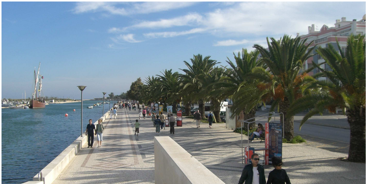
Boulevard of Lagos. On the left the canal leading to the Atlantic ocean and left the old centre of the town

Because it is still early, we decide to go to the centre of Lagos. We have not been there yet. Lagos has a nice boulevard with the old town centre on the other side of the road. Lagos is also a tourist