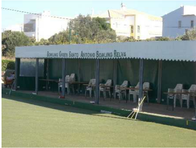
Bowlinggreen in Alvor. De name of the de club is San Antonio Lawn Bowling

The weather forecast is a little less promising today, they even expect a bit of thundery weather. At 11.00 o'clock we play bowls at Alvor. TomTom gave us a nice short route from Meia Praia to the bowls green. We did put the exact GPS-location in our TomTom, so it guided us via a nice route through